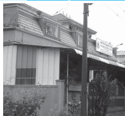
This dubious clinic is located at Neyveli , BHMS and MD(hom) physicians are quiet surprised over these degrees and affiliation