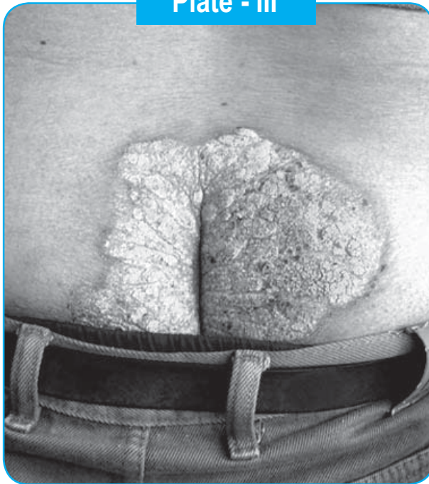
Plate - III